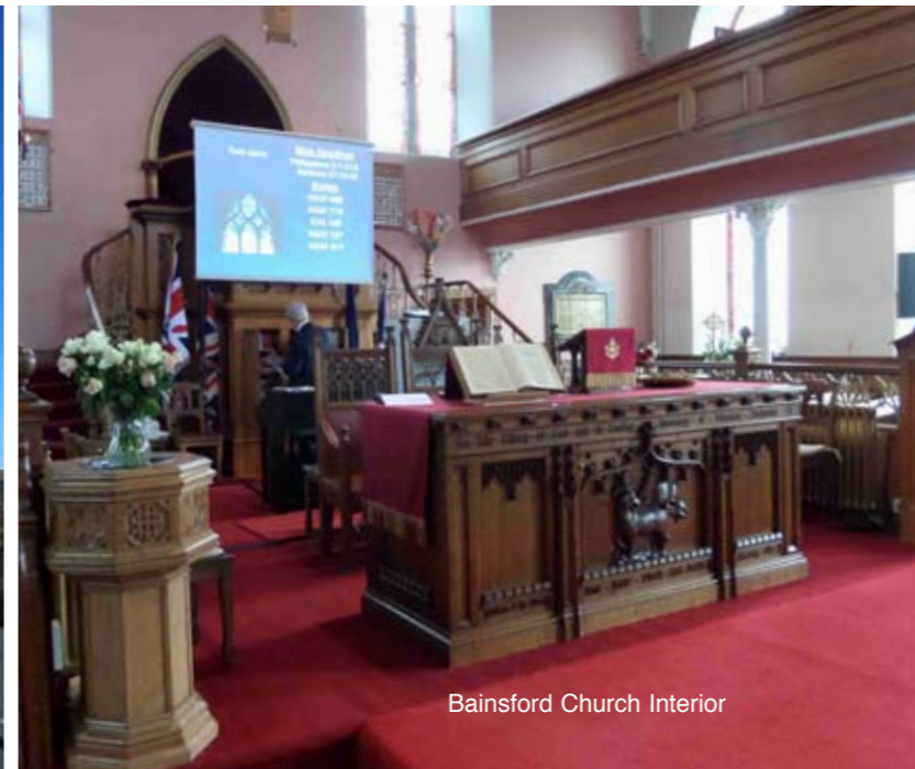
Bainsford Church Interior