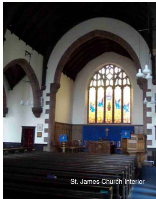
St. James Church Interior