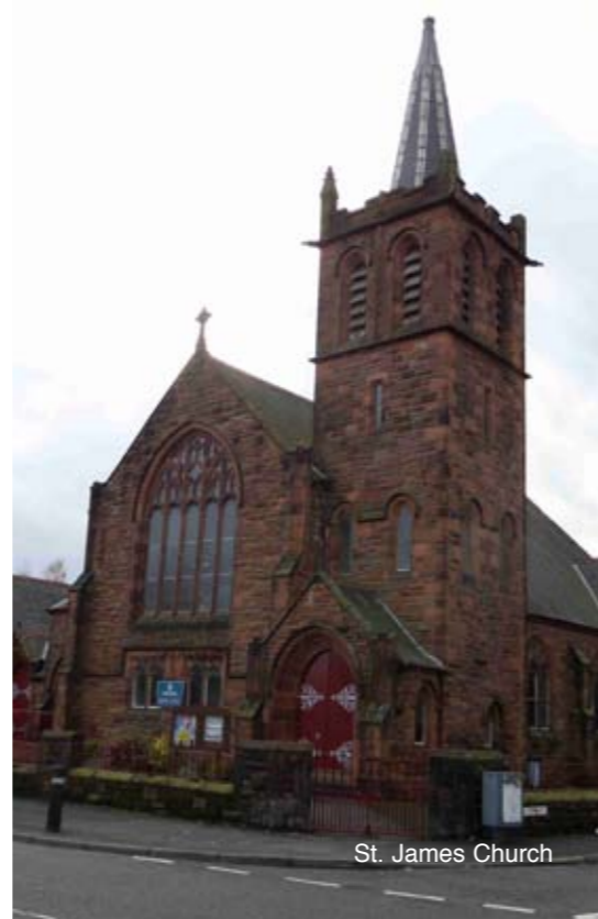
St. James Church

12 elders form the Kirk session and Deacon's Court, but are willing to consider altering the status to Model Constitution. They meet concurrently approx. 6 times per annum.