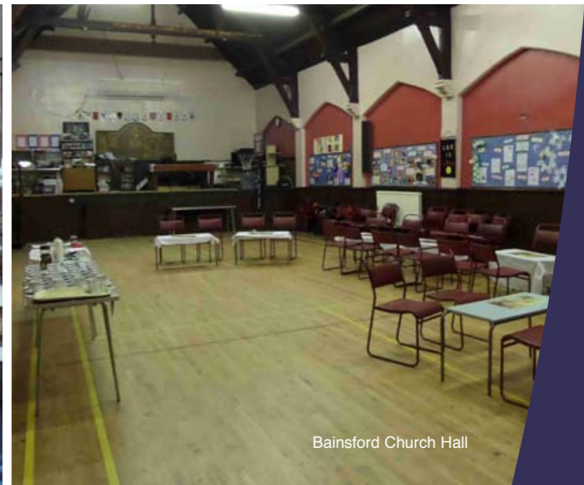
Bainsford Church Hall